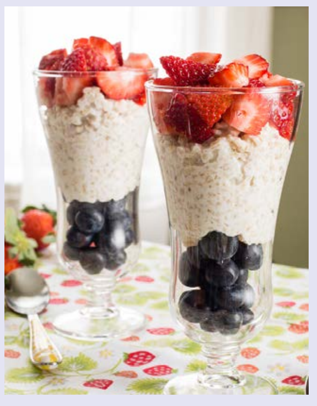
▲ Fourth of July Parfait