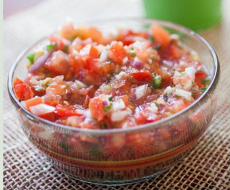
Corny Tomato Pasta Salad